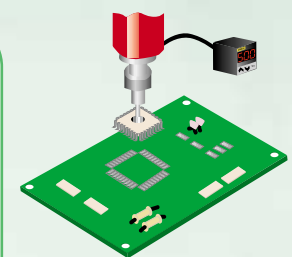
These programming methods are ideal for detection applications.